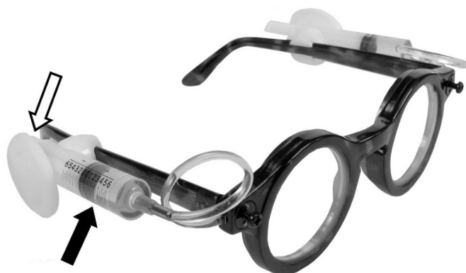
Fig 1 Adjustable spectacles: open arrow indicates adjustment knob, solid arrow indicates dioptre scale on user controlled pump. Lens can be sealed and adjustment mechanism removed after desired power is obtained